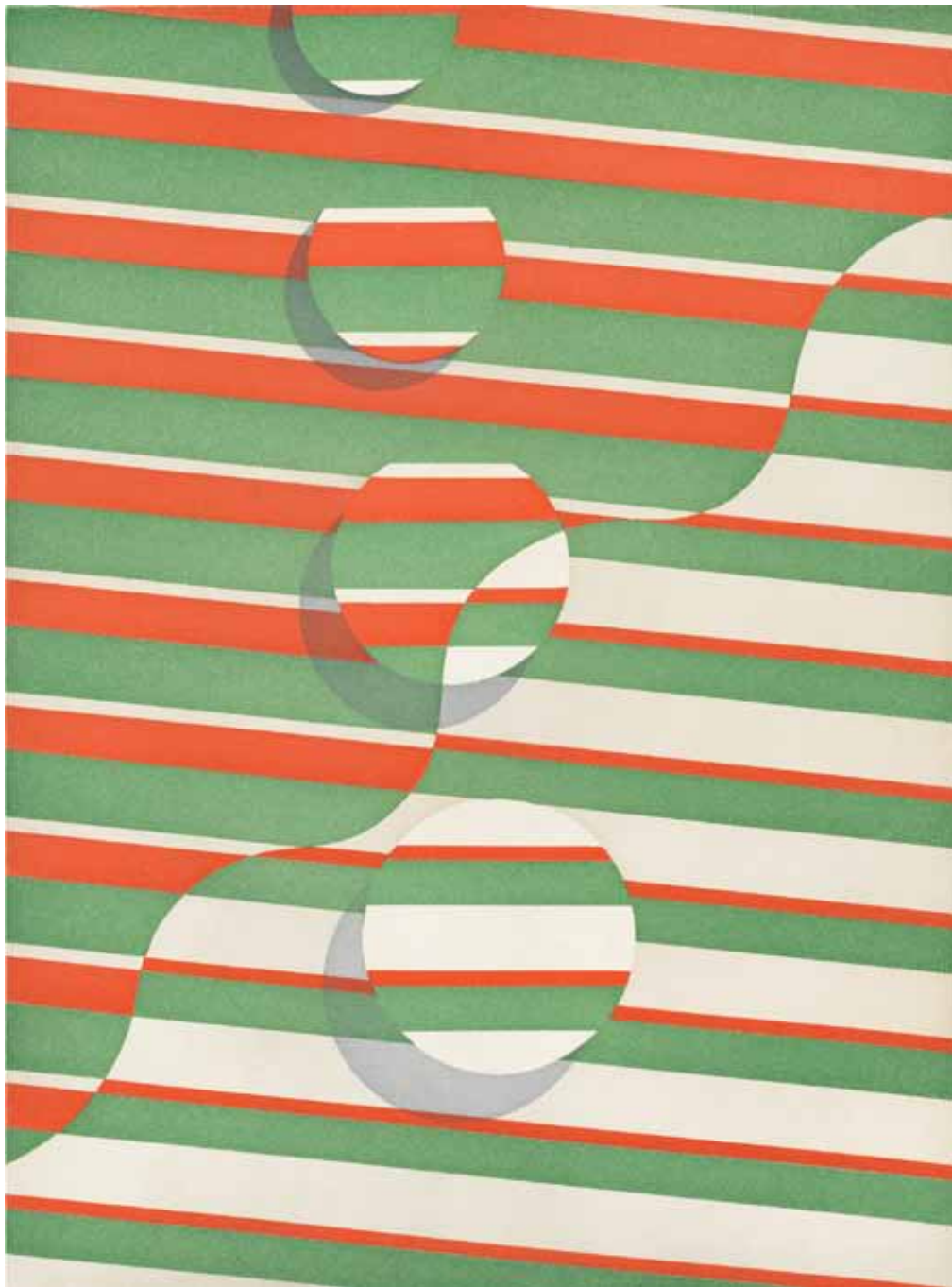
Untitled (wavy line) , 2015. Color aquatint. 22¾-x-16¾-inch image on 29¼-x-22¾-inch sheet, edition 20.