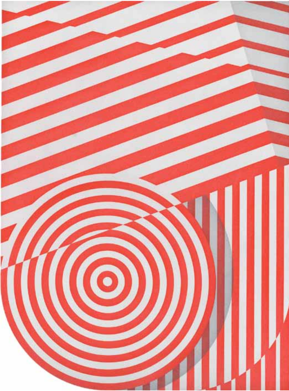
Untitled (big circle) , 2015. Color aquatint. 22¾-x-16¾-inch image on 29¼-x-22¾-inch sheet, edition 20.

This was my second project at Crown Point Press, so I was familiar with the technical possibilities of the etching medium. In my first project I used small drawings as a guideline to my approach. The drawings are eclectic in form and material, and the process of developing the prints was very open and ran parallel to my learning about the various techniques. I would say that the images in my first project are the result of discovering the technique.