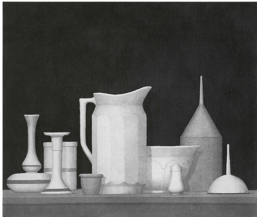
Viale , 2002. Hard ground and soft ground etching with aquatint. Paper size: 26 x 28"; image size: 15 x 17-3/4". Edition 25. Printed by Case Hudson.