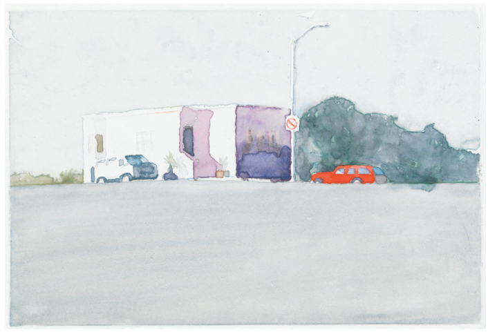
19th and Pennsylvania (4)

above it that are washed out in bright light. The shape could be a shimmer in the windshield or in your glasses or in the street itself and it weights the lower corner of the scene, balancing the dark blue above. The artist kept for himself one of these works. Which one do you think he chose? I'll tell you after we talk about 19th and Pennsylvania .