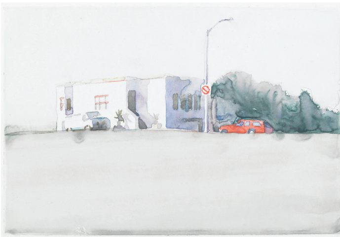
19th and Pennsylvania (3)