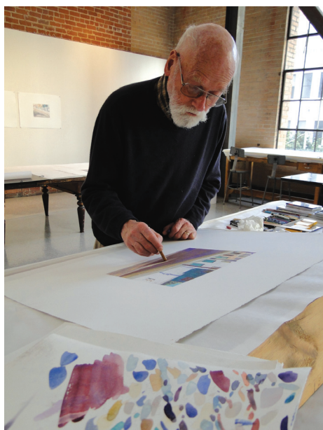
Robert Bechtle in the Crown Point studio, 2013.