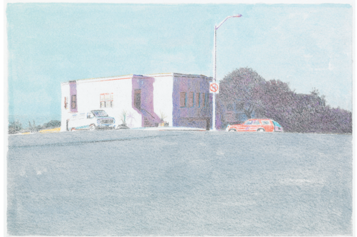
19th and Pennsylvania (2)