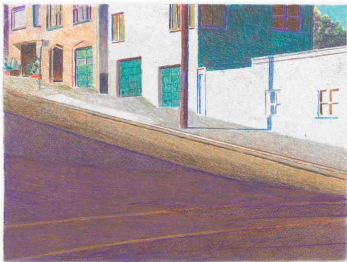
Arkansas Street (1) , 2013. Watercolor monotype. 8¾-x-11¾-inch image on 17½-x-20-inch sheet. All monotypes printed by Ianne Kjørli.