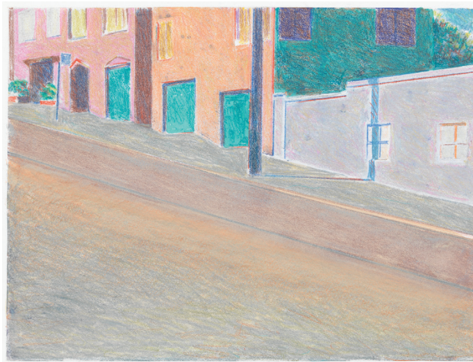
Arkansas Street (4)