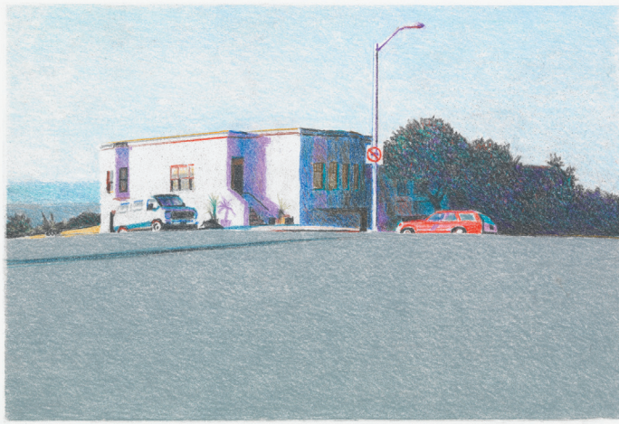
19th and Pennsylvania (1) , 2013. Watercolor monotype. 7¾-x-11¾-inch image on 16½-x-19¾-inch sheet.