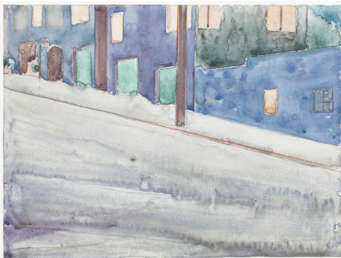
Arkansas Street (3)