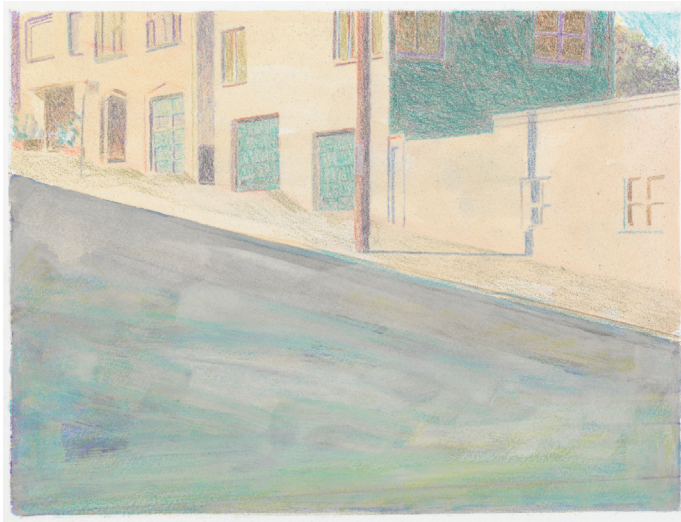
Arkansas Street (2)