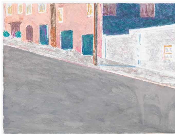
Arkansas Street (6)