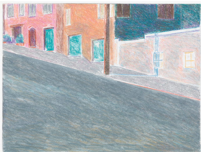
Arkansas Street (5)