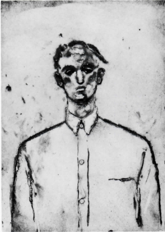
Katsura Funakoshi, Words on the Wall , 1993, manipulated aquatint with flat bite and drypoint; paper size: 40½ x 30¾"; image size: 29¾ x 21¾", edition 30.