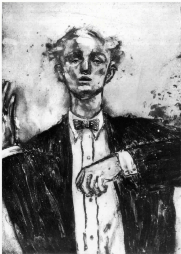
Katsura Funakoshi, Irregular Caesuras , 1993, manipulated aquatint with flat bite and drypoint; paper size: 40½ x 30¾"; image size: 29¾ x 21¾", edition 45.