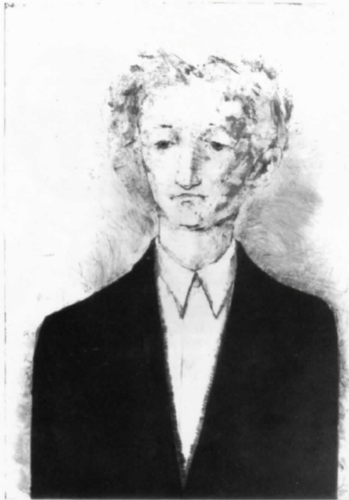
Katsura Funakoshi, Quiet Summer , 1990, soap ground etching and drypoint; paper size: 41 \frac{1}{2} x 31 \frac{3}{4} "; image size: 26 \frac{3}{4} x 19 \frac{1}{4} ", edition 30.