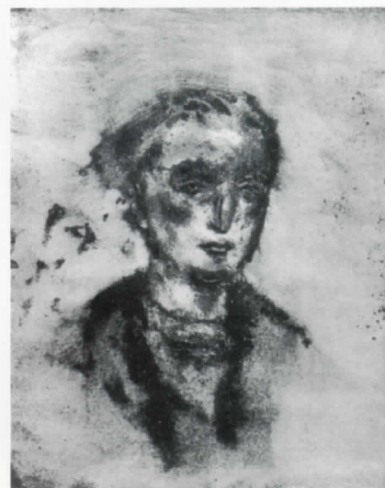
Katsura Funakoshi, The Guest of Winter , 1993, manipulated aquatint with flat bite, spitbite, softground and drypoint; paper size: 26½ x 22½"; image size: 17¾ x 14¾", edition 30.