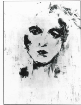
Katsura Funakoshi, The Book Half Read , 1990, soap ground etching and drypoint; paper size: 26 \frac{1}{2} x 20 \frac{1}{2} "; image size: 15 \frac{1}{2} x 11 \frac{3}{4} ", edition 30.

Their point of view, according to Shinji Kohmoto, Curator of the National Museum of Modern Art in Kyoto, is not absolute, but rather accepts the existence of many values, which they believe can be active at the same time. Kohmoto points out that the Japanese language is not analytical and has few adjectives and many nouns. "When a Japanese person faces an impressive landscape, he simply describes exclaimatorily how impressive it