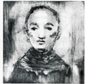
Katsura Funakoshi, The Old Mirror , 1993, manipulated aquatint with flat bite and drypoint; paper size: 30 x 22½"; image size: 11⅞ x 11⅞", edition 30.