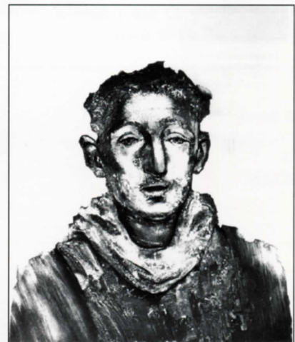
Katsura Funakoshi, Carrying Words , 1993, manipulated aquatint with flat bite and drypoint; paper size: 26½ x 22½"; image size: 17⅞ x 14½", edition 30.