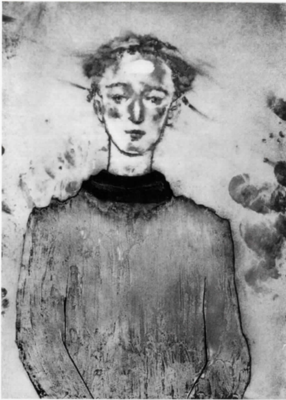
Katsura Funakoshi, The Teachings of Winter , 1993, manipulated aquatint with flat bite, aquatint reversal and drypoint; paper size: 40½ x 30¾"; image size 29¼ x 21¾", edition 30.

During this project Funakoshi concentrated on the idea of manipulating the rosin powder used for aquatint. He applied the loose powder, then distributed it with a brush, and melted it with a blow torch to adhere it to the plates. He also heavily scraped and burnished after etching. The process gives each of the seven, largely black and white, prints a unique texture and dimensionality.