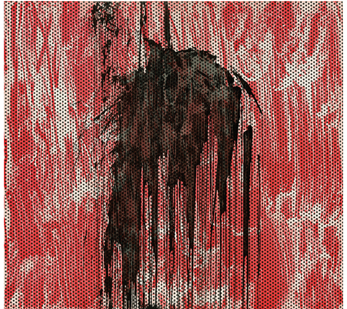
Untitled (red) . Color soap ground aquatint with aquatint.

"The central image in these prints originates from a series of paintings I made in 2023. I was fascinated by the public actions of the Just Stop Oil activists, who protested climate change policy by throwing and spraying these paint pours and splatters that resembled the gestures of paintings I made earlier in my career. I thought if I pre-vandalize my paintings, maybe this would protect them from future vandals... or even provoke further attention to painting within the social media landscape in an unexpected way, revealing how social tensions coalesce around the contemplation of art." — Jacqueline Humphries