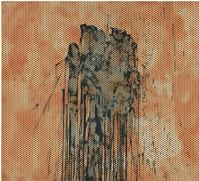
Untitled (sienna) . Color soap ground and spit bite aquatints with aquatint.