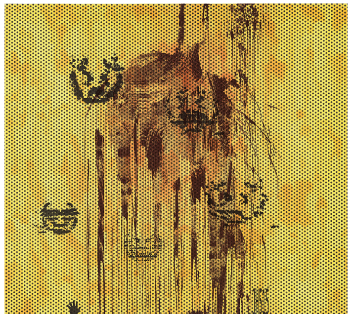
Untitled (yellow) . Color soap ground, spit bite and sugar lift aquatints with aquatint.

Jacqueline Humphries was born in 1960 in New Orleans. She has lived and worked in New York since the 1980s. Her work is in the collections of many art institutions including The Museum of Modern Art; Whitney Museum of American Art; Solomon R. Guggenheim Museum; Metropolitan Museum of Art; Hirshhorn Museum and Sculpture Garden; Museum of Contemporary Art, Los Angeles; San Francisco Museum of Modern Art; de Young Museum; and Tate Modern. Jacqueline Humphries is represented by Greene Naftali Gallery, New York and Modern Art, London.