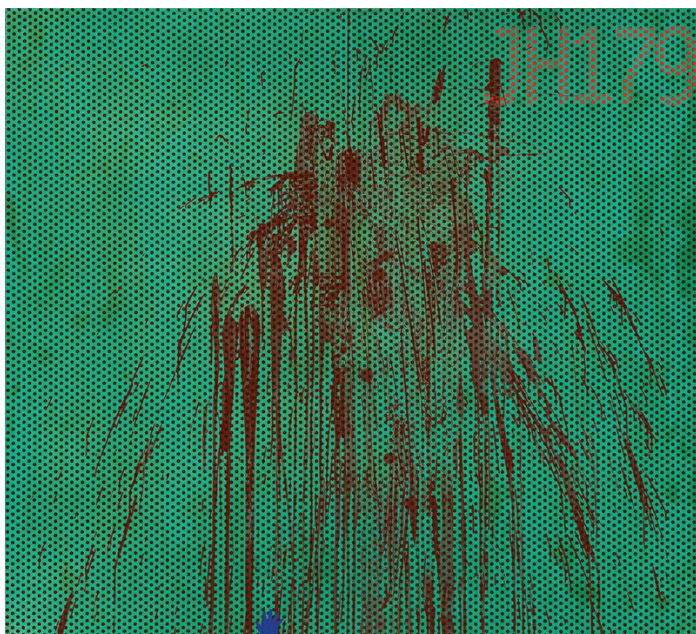
Untitled (green). Color soap ground and spit bite aquatints with aquatint and hand stenciling.