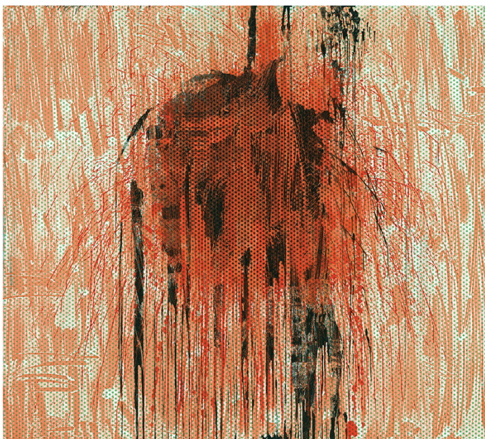
Untitled (orange). Color soap ground and spit bite aquatints with aquatint and drypoint.