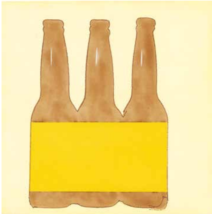
Three of a Kind . Color spit bite aquatint with aquatint and soft ground etching. 11-x-11-inch image on 17½-x-17-inch sheet, edition 25.