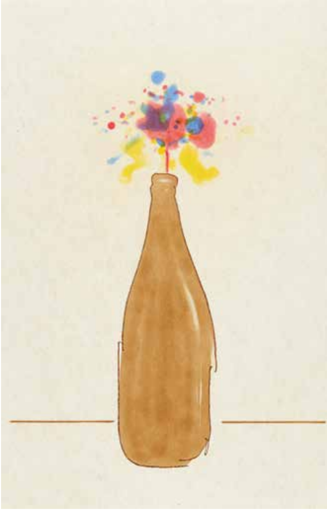
Beer Bottle Bouquet . Color spit bite aquatint with aquatint and soft ground etching on gampi paper chine collé. 14-x-9-inch image on 20½-x-15-inch sheet, edition 25.