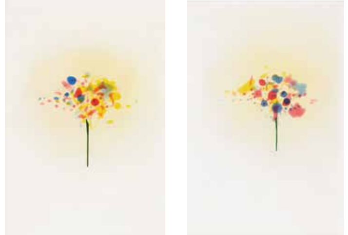
Particle Accelerator (left); Collision Debris (right). Color spit bite aquatints with dry-point. Each image measures 8¼-x-5½-inches on a 13½-x-10½-inch sheet, edition 20.

Conceptual Art and Beer with Friends as my public or social art.”