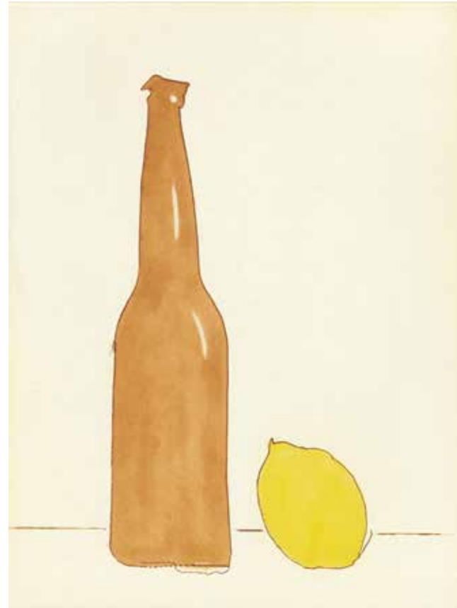
Beer with Lemon . Color spit bite aquatint with aquatint and soft ground etching. 12-x-9-inch image on 18½-x-15-inch sheet, edition 25.

would be a clue; the only way to make music would be to blow into the bottles. But the bottles might also suggest different types of people, different sizes, shapes, and colors. That would be good, too. You can see anything you want in it, but the more you know, the more you can see. That's a nice thing about art."