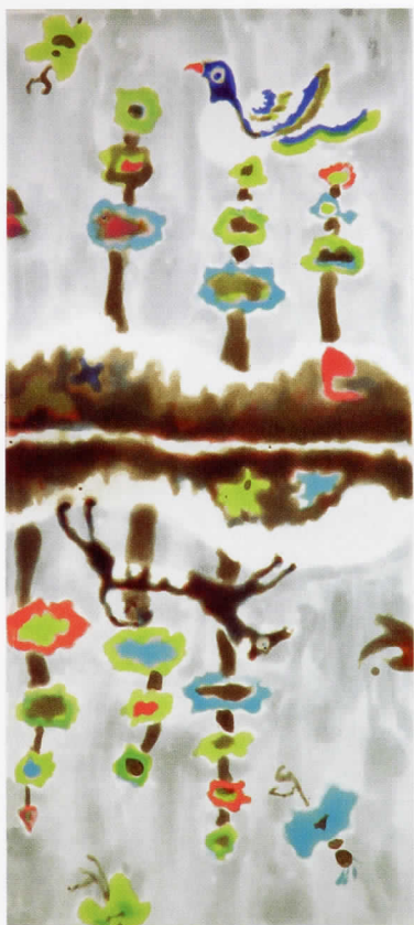
Laura Owens, Untitled (LO 269) , 2004. Color spit bite aquatint. Paper size: 25-1/2 x 15"; image size: 15-1/2 x 7" Edition 40. Printed by Dena Schuckit.

prancing horse that ended up blue in the finished work—this was the last print finished, though the first begun. She had brought illustrated books with her—I remember one on American folk art and another on Japanese brocades—but the horse came from her imagination and she drew it several times on paper before she drew it on a copper plate. Over the course of the project, she became skillful with spit bite aquatint, painting acid on the various plates. As time went on, the horse became muscular as she bit the plate again and again. She was delighted that once an image is etched in the plate it remains the same through unlimited color trials, unlike painting where changing colors means adding paint, or scraping and adding, and consequently changing the structure of the work.