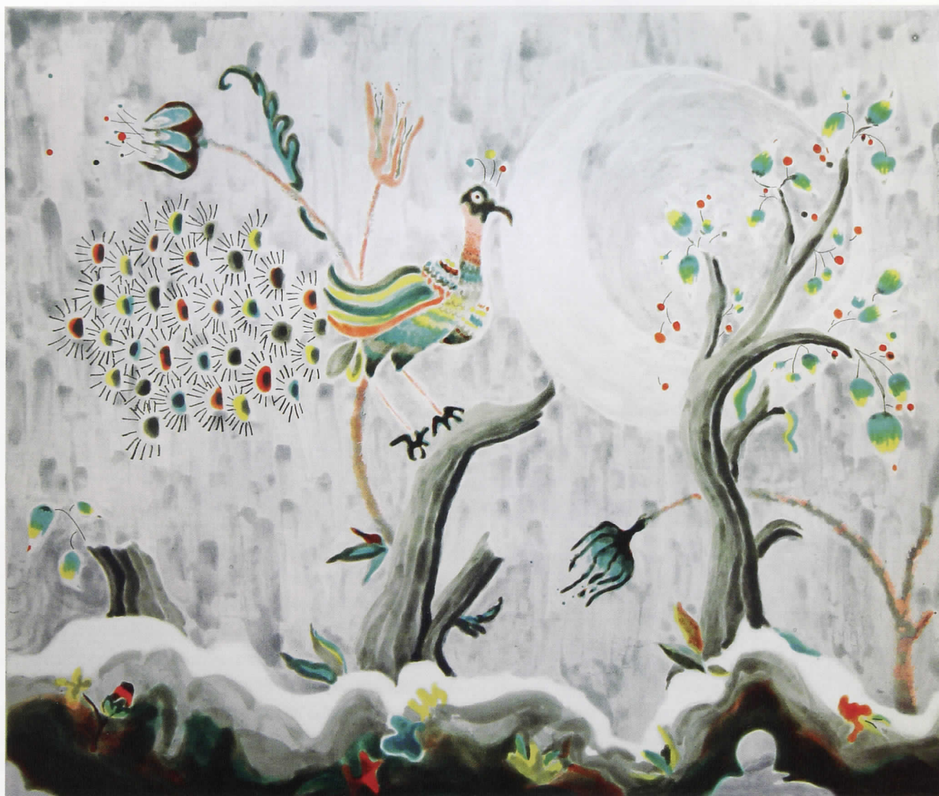
Laura Owens, Untitled (LO 272) , 2004. Color spit bite aquatint with soft ground etching. Paper size: 39-1/2 x 44-1/2"; image size: 29-1/2 x 35-1/2" Edition 40. Printed by Dena Schuckit.