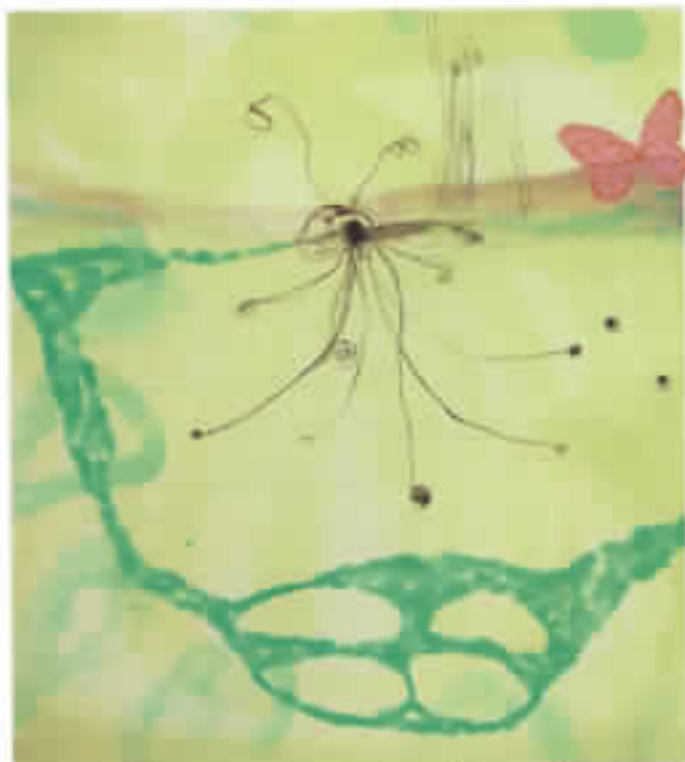
Julia Provisor, Honey Bee , 2004. Gilted-egg lin and sugar ink splatters with drips and pinned collage elements on Gampi paper (china silk). Paper size: 29 3/4 x 40 1/4"; image size: 20 3/4 x 29 3/4". Edition 15. Printed in East York.

with the psychological tension evident in Provisor's painting. Like Bada, her work is direct, intuitive, and spontaneous, full of private symbols and secret meanings."