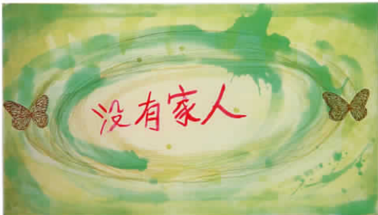
Janis Provisor, Nobody , 2004. Color spit bite and sugar lift aquatints with hard ground etching and printed collage elements on Gampi paper (show only). Paper size: 26-1/4 x 39-1/2"; image size: 17-3/4 x 31-1/4". Edition 20. Printed by Emily York.

neous feelings of rootedness and of not belonging anywhere."