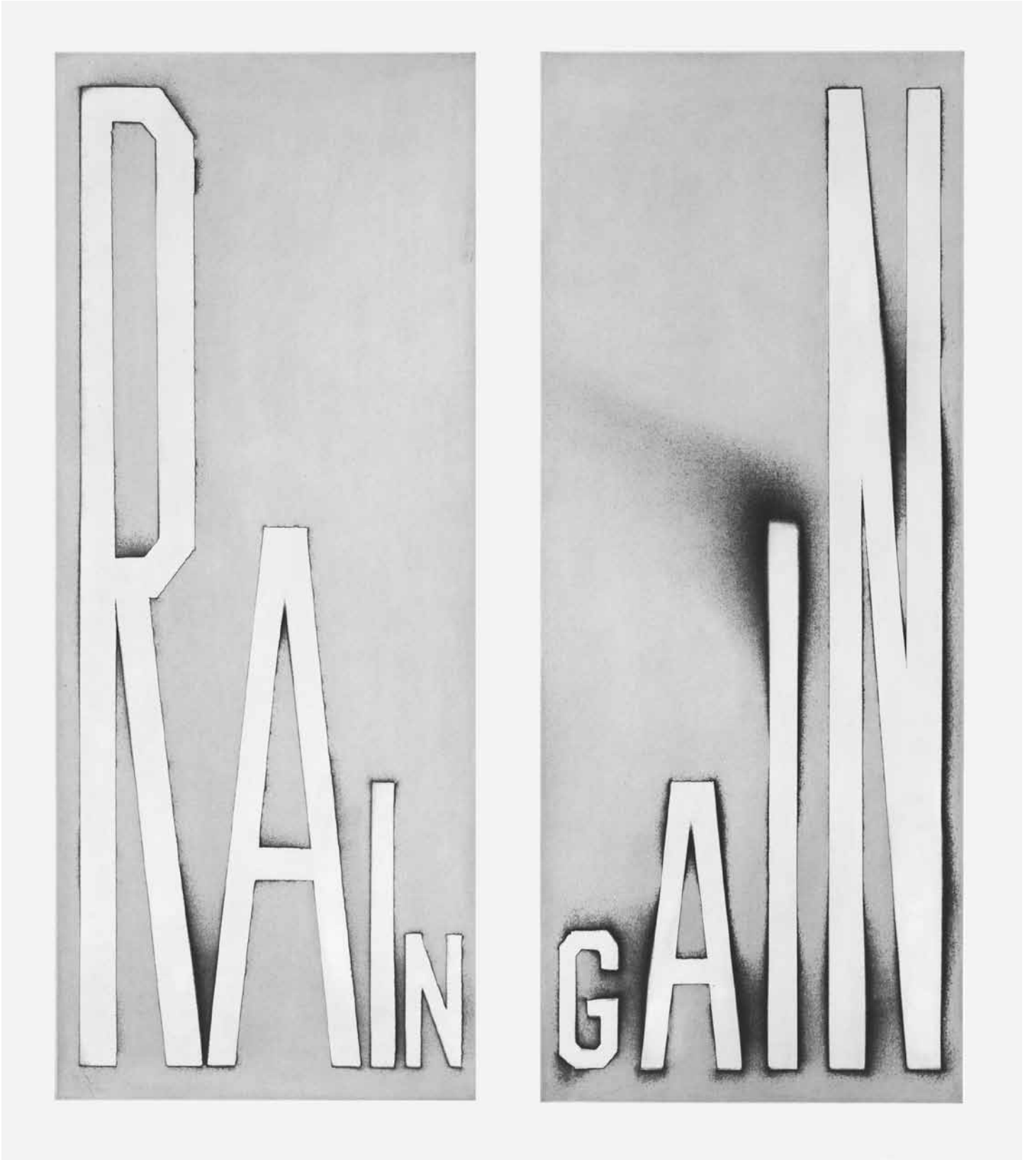
Rain Gain , 2014.

"These prints came out of pencil sketches resembling standing soldiers or skinny skyscrapers. The technical side was influenced by the Joan Miro playbook of open bite intaglio. The figures 'bleed' excess ink to define the images." Ed Ruscha