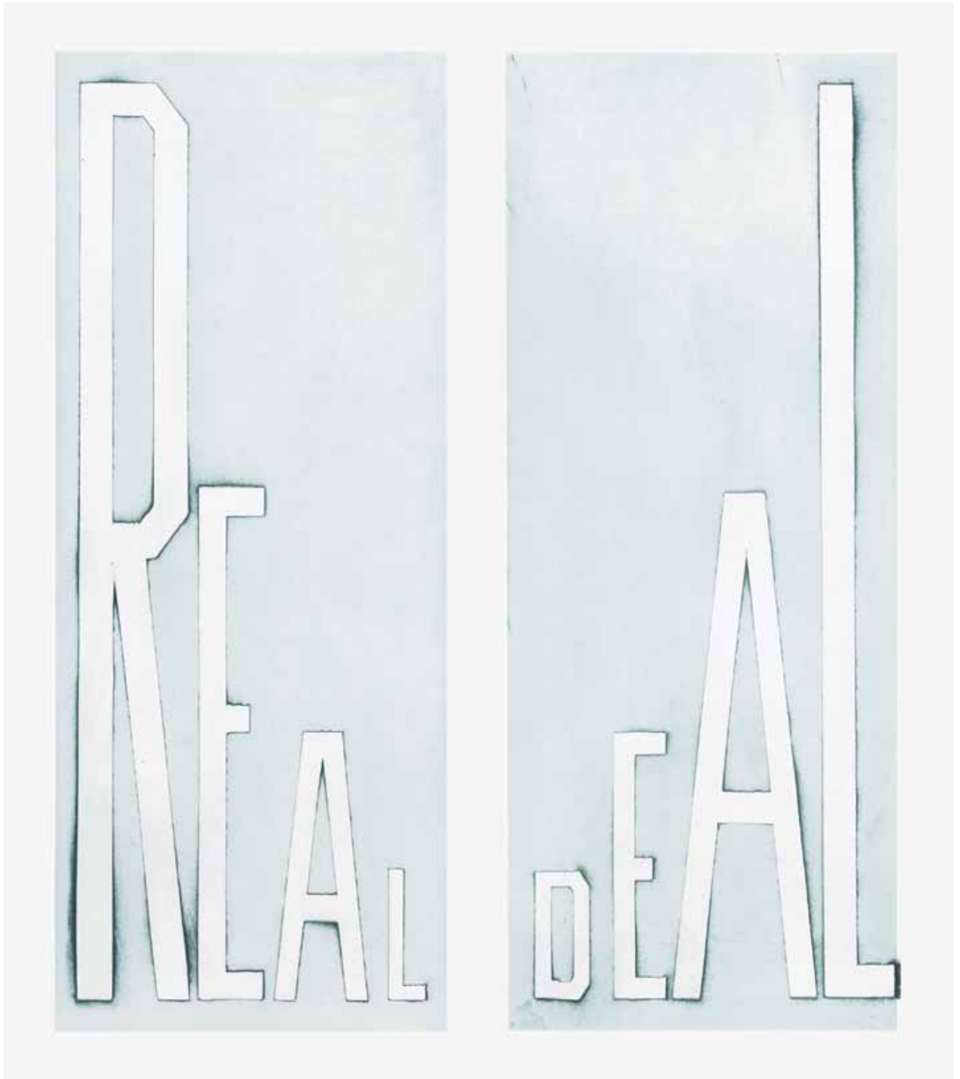
Real Deal , 2014. All three images in this newsletter are flat bite etchings (also called open bite) in editions of 40. Each measures 29½-x-25½-inches on a 36½-x-31½-inch sheet. They were printed by Emily York. Visit crownpoint.com for prices and information.