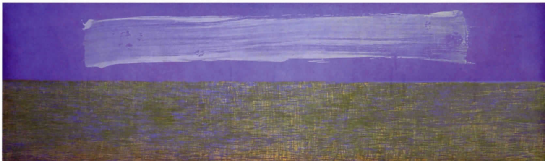
From the Boat: Horizon