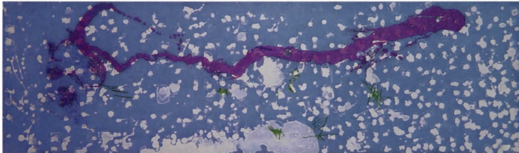
From the Boat: Constellation