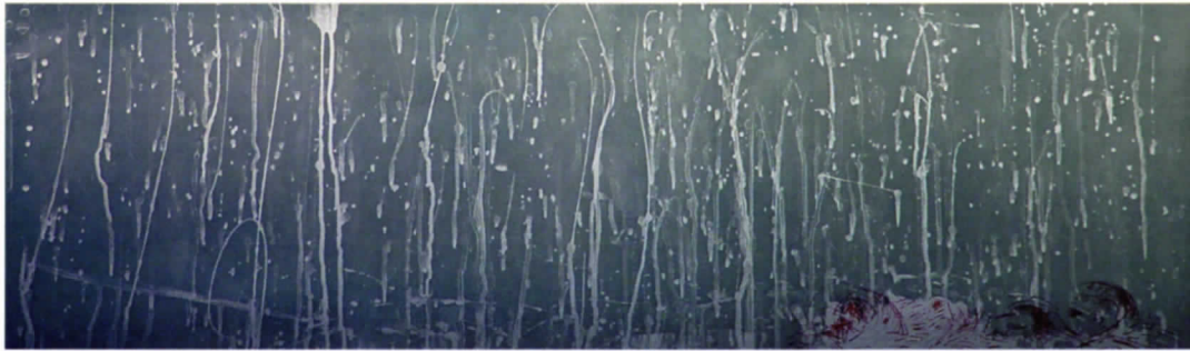
From the Boat: Rain