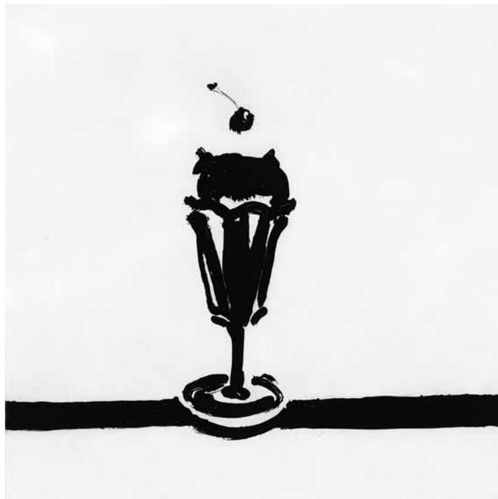
Clockwise from top left: Crown Tart , direct gravure; Dark Bird , direct gravure; Tulip Sundae , sugar lift aquatint with drypoint; Cut Cakes , sugar lift aquatint with drypoint. Each image printed in an edition of 35 by Emily York, 2015. Visit crownpoint.com for more information.